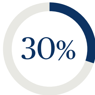
Inactive Necessary Files